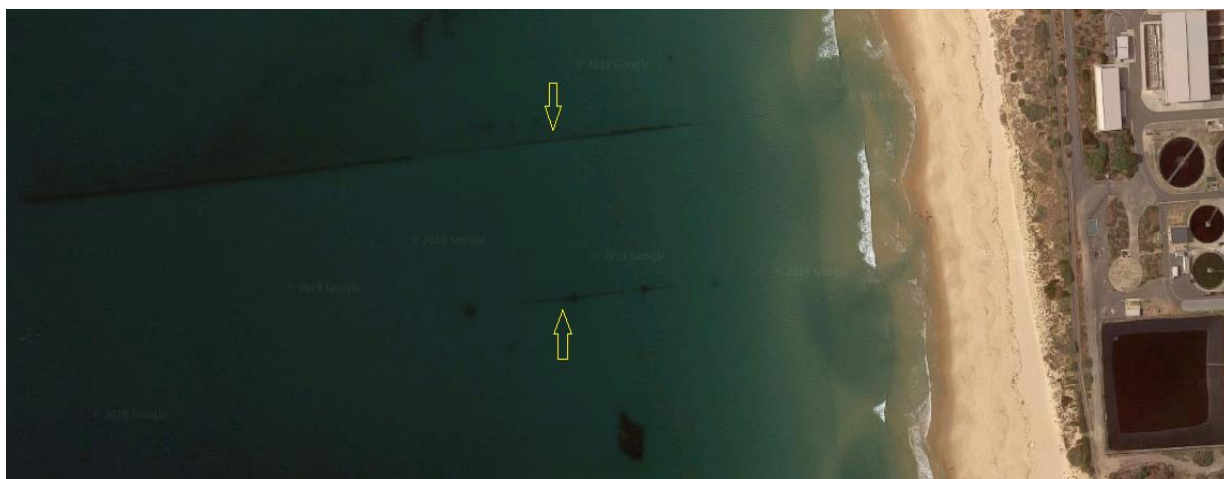
Figure 3. An example of a coastal outfall for Christies Beach WWTP, South Australia.

Yellow arrows point to the two outfalls (black line).